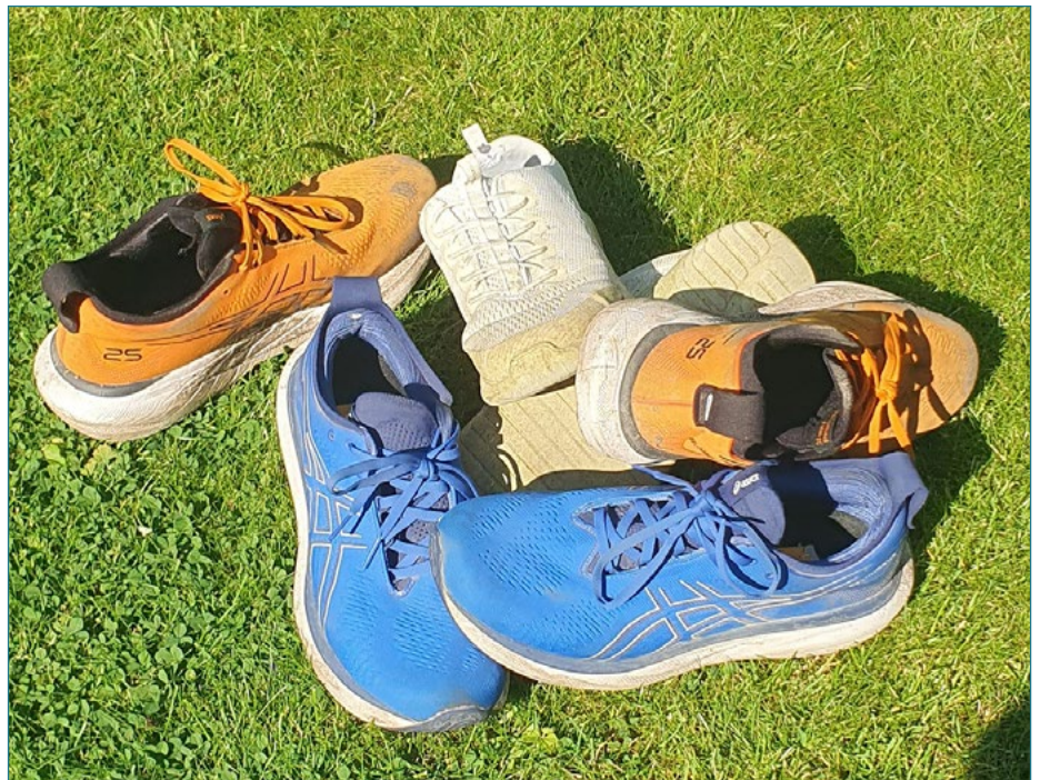
Running every day takes a toll on your trainers!

In my first few months with the NCA, a colleague who was himself a Commonwealth Games Silver Medallist (and who has since left the Agency) told me to think of exercise as an investment, not a pastime – an investment in your future to give